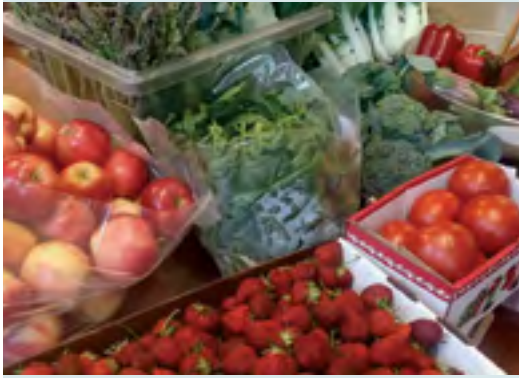
A FOOD HUB DELIVERY RECEIVED BY BAXTER CDC IN EARLY JUNE FROM WEST MICHIGAN FARMLINK